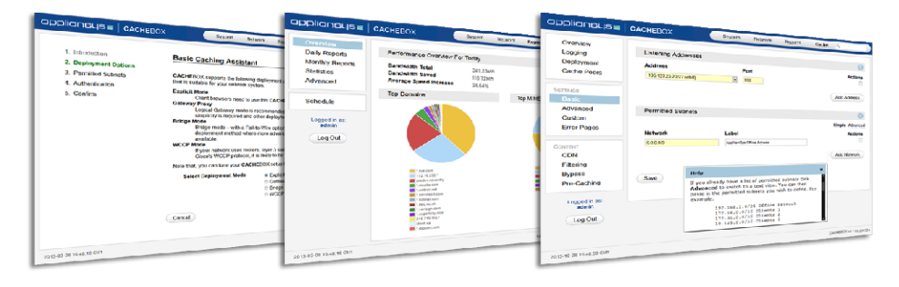
Configuration wizards, graphical reporting and online help

"Web pages that are very often accessed within the company download at an incredible speed. And if in doubt, we now have a control list of all visited websites." Edicions Bromera, Spain